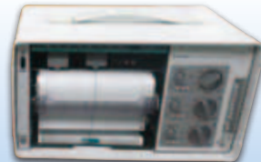
[ Previous HIOKI model: EPR-3500s ]