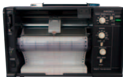
Pictured: PR8111 (1-pen model)