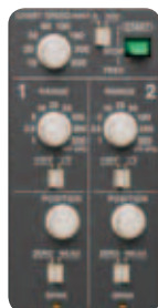
Operating panel (2-pen model)