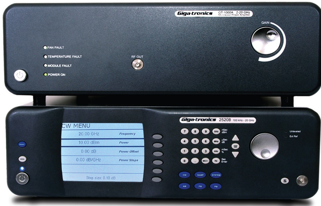
The Titan System