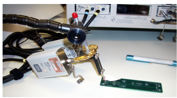
Fig 2) For a faster TDR pulse, remove the cable and directly connect the GigaProbes<sup>™</sup> directly to the TD sampling head via a high speed coupler.