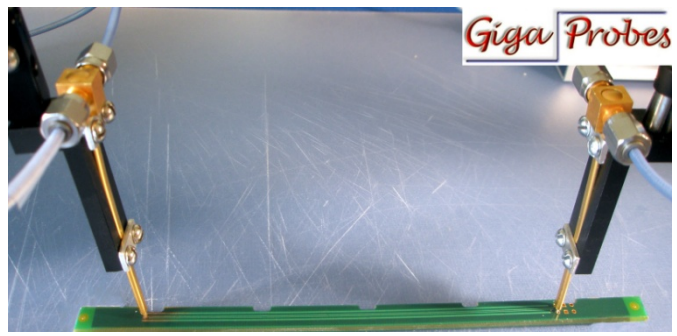
Fig. 1) Two GigaProbes<sup>™</sup> connected through SMA cables and to the TDR heads are used to acquire the differential Reference (Open), TDR, TDT Waveforms and ported into IConnect® for processing.